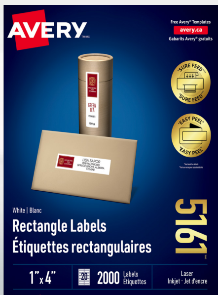
Labels, Page 2