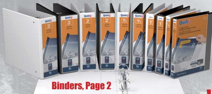
Binders, Page 2