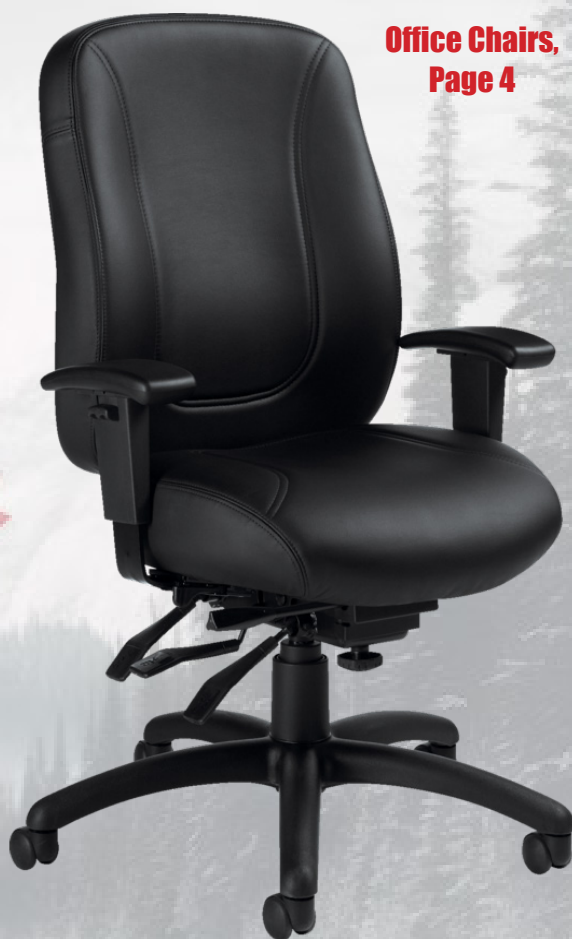
Office Chairs, Page 4