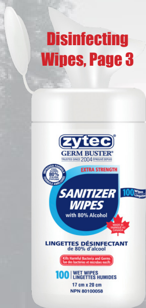
Disinfecting Wipes, Page 3